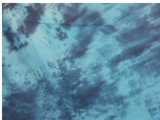
Blue Tye Dye