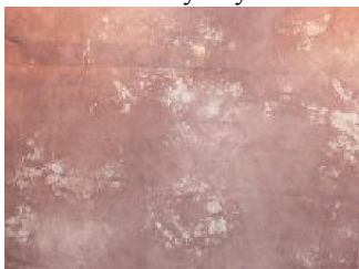
Brown Tye Dye